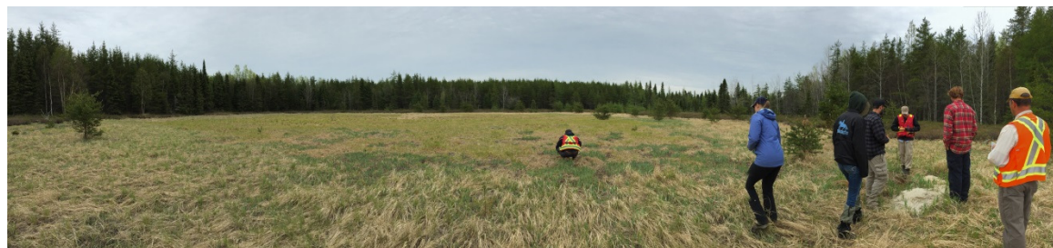
Panoramic photograph of LU students and OGS Geologists visiting a potential kimberlite target in the Marathon area, Summer 2014