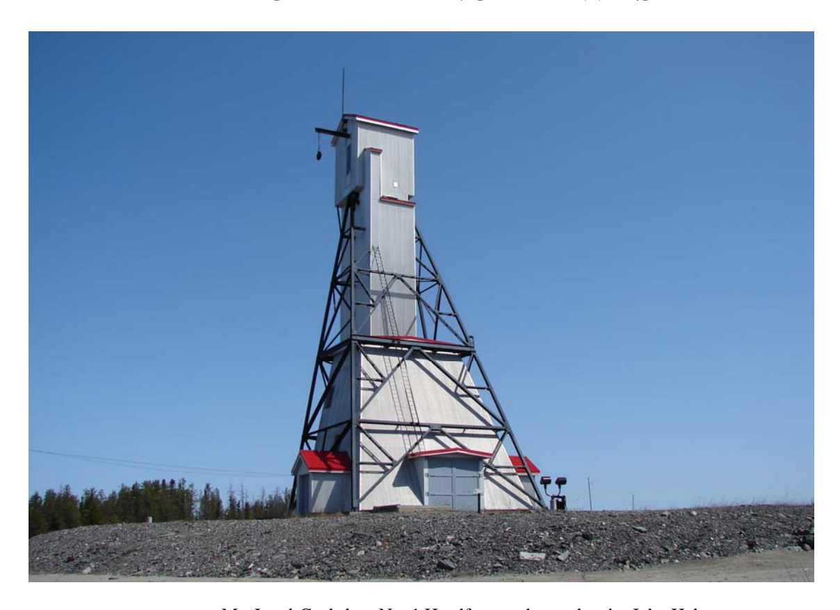
MacLeod-Cockshutt No. 1 Headframe